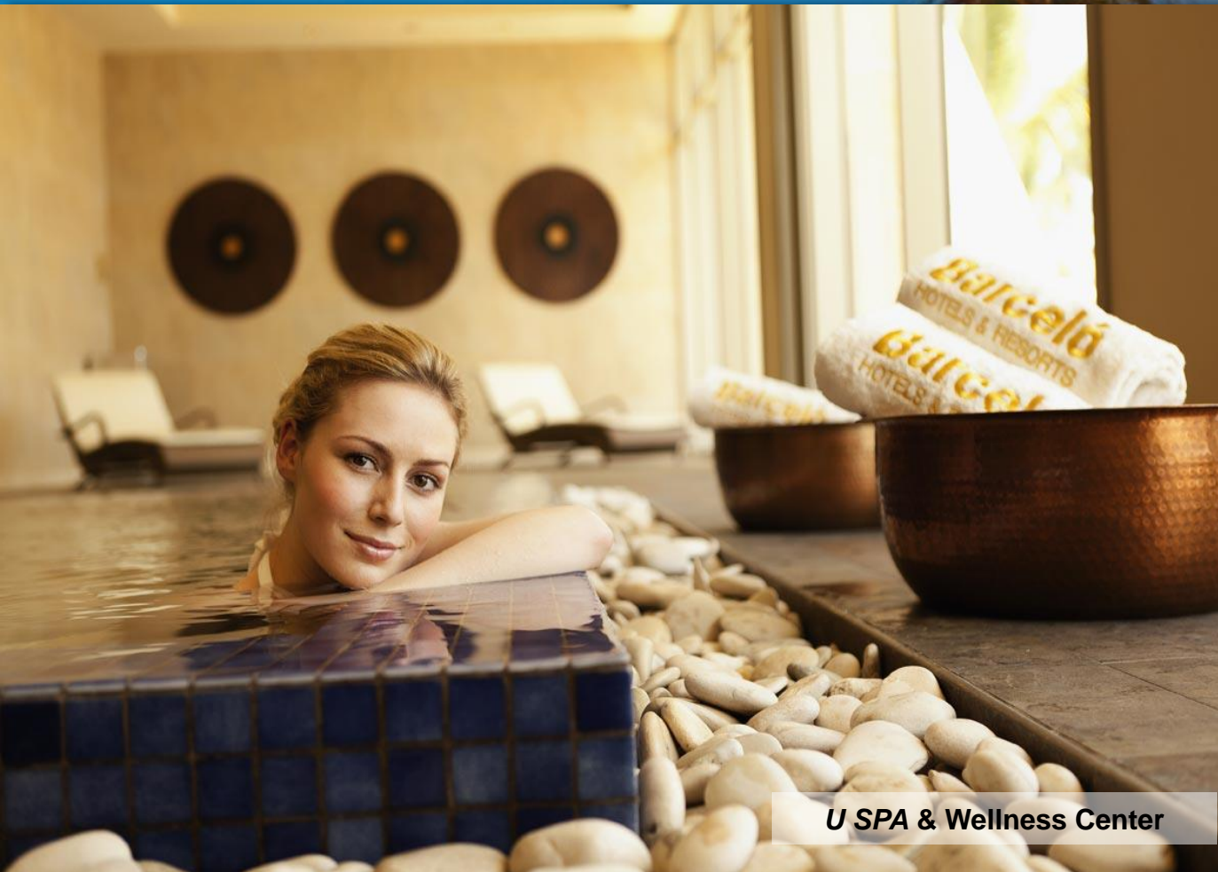
U SPA & Wellness Center