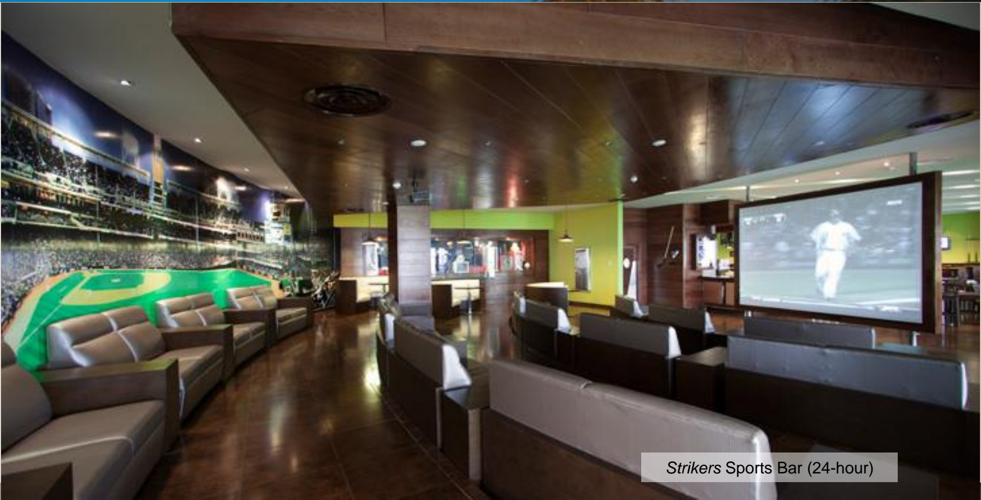
Strikers Sports Bar (24-hour)