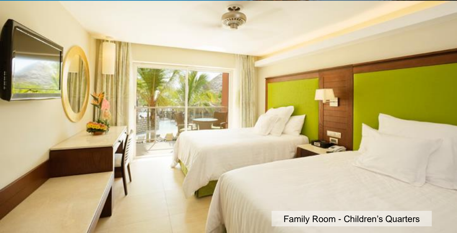
Family Room - Children's Quarters