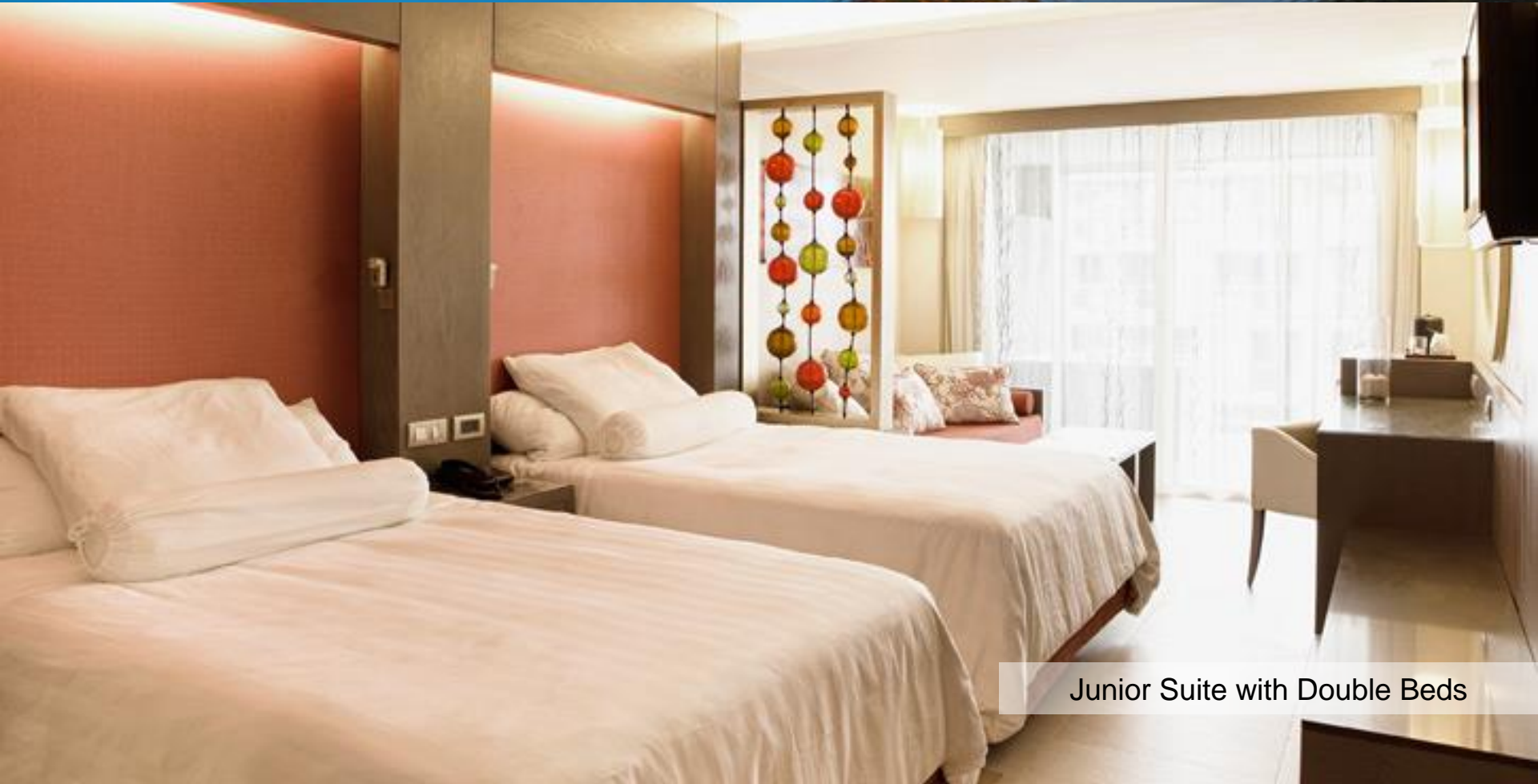
Junior Suite with Double Beds