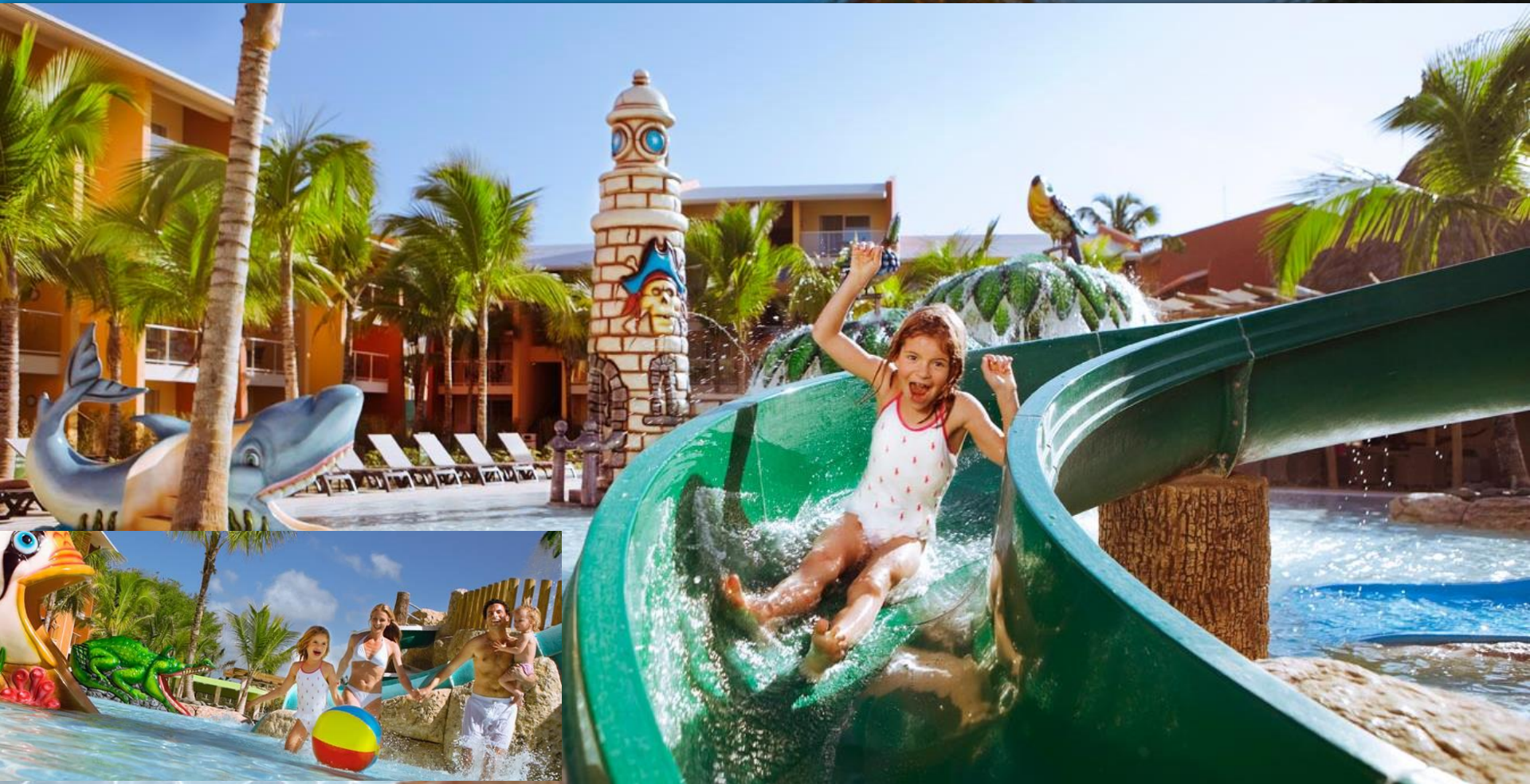
Children's Water Park