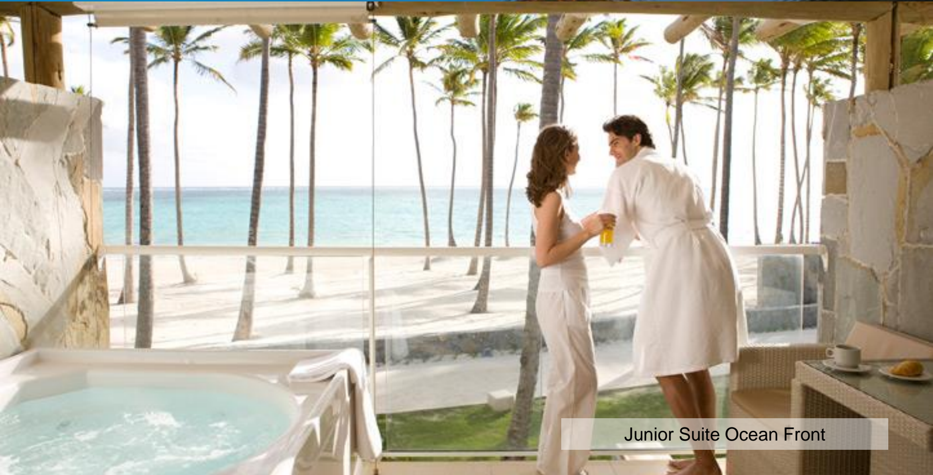
Junior Suite Ocean Front