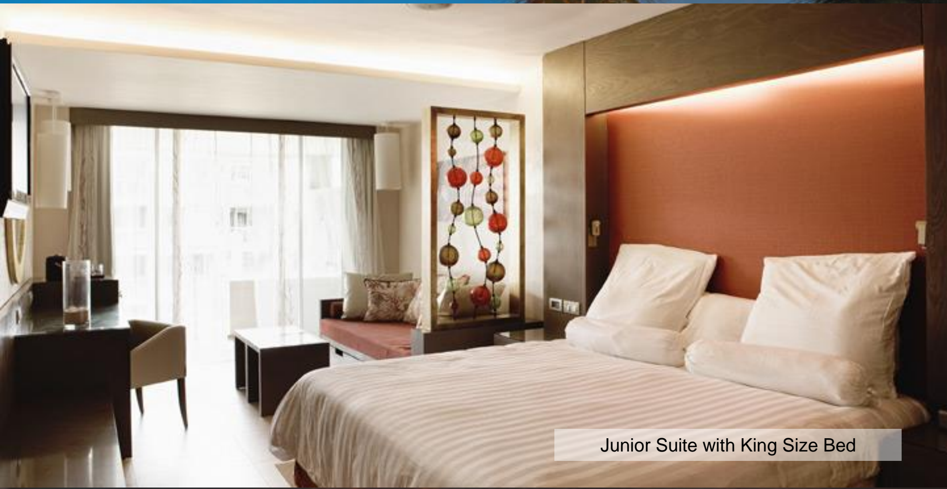
Junior Suite with King Size Bed